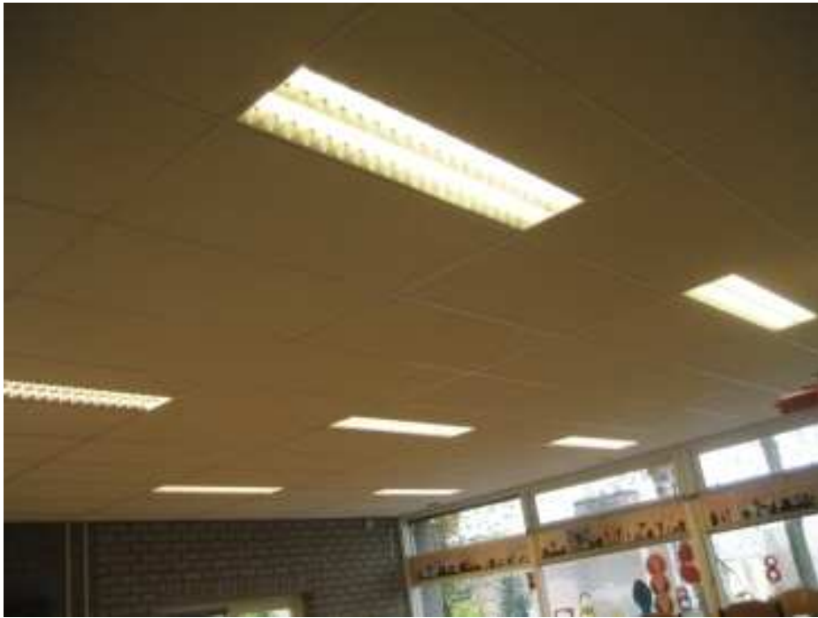
Figure 1. Conventional lighting system in the control school/classroom and the experimental school/classroom (pretest)